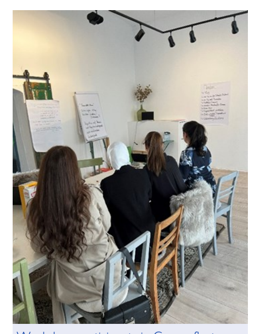
Workshop participants in Graz reflect on their discussions.

Lastly, we extend a special thank you to all the young participants who engaged in our workshops or served as multipliers. Their motivation, dedication, and courage have been instrumental in our project's success. Together, we have cultivated a space defined by diversity and inclusion.