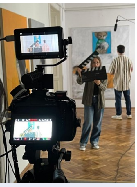
Workshop participants filming the short film "10 CENTS".

Our most recent short film "10 CENTS - A Comedy of Mistaken Identities" is also available online. In this short comedy clip, teenagers with a migrant background from Vienna, Austria, humorously depict everyday discrimination. They draw attention to this important topic through a story they scripted and directed themselves. We eagerly anticipate your views, likes, and comments!